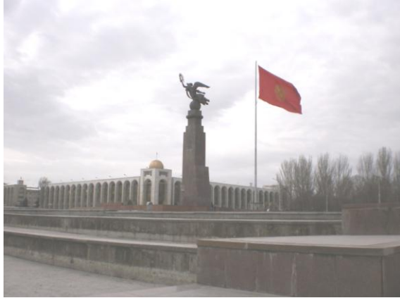
Ala-Too Square in Bishkek. March 2010. Just three weeks after I took this photo, revolution broke out and Ala-Too Square was the scene of some of the heaviest fighting. The building on the far left was a burned out shell when I returned a year later.