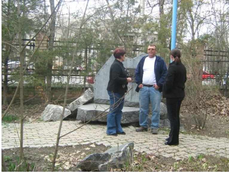
At the memorial to the victims of Soviet genocide.