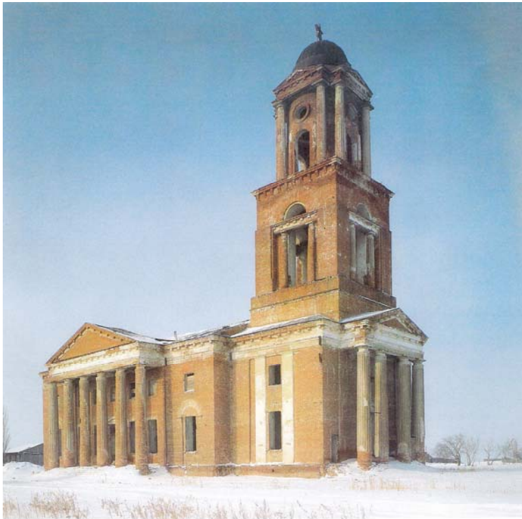
v.-latfn. Kirche in Warenburg (Privolnoje) - Лютеранская церковь в с. Привольное (Варенбург)

village and colony were founded. Here in this square the Church stands.