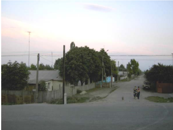
Strasse Nabereschnajaint Louis