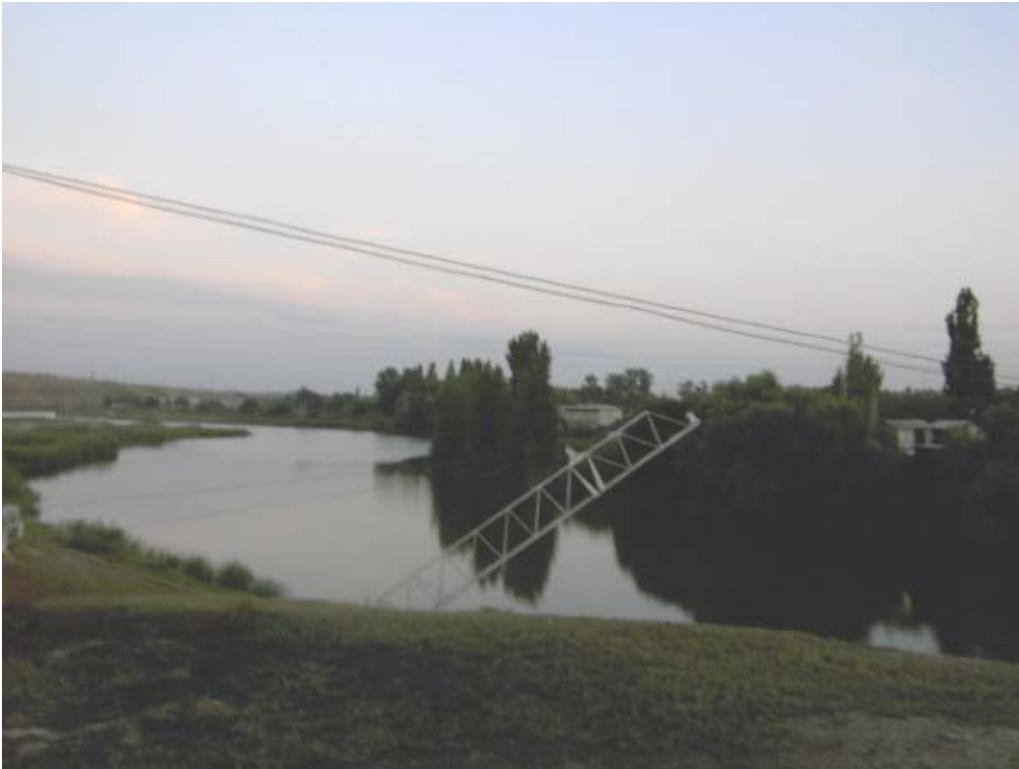
Karaman River in Louis